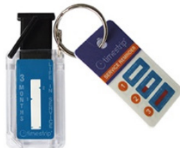
3 Month Keychain 6 Month Keychain or 12 Month Keychain 19mm x 40mm